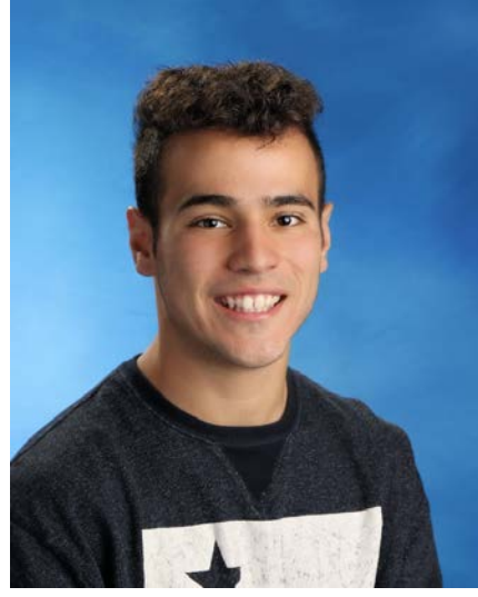
Artem Moiseev College